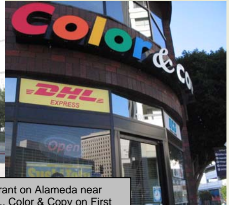
Clockwise: Comida Cubana Restaurant on Alameda near First St., California Floral on First St., Color & Copy on First & San Pedro, and Wireless Direct on Second St.